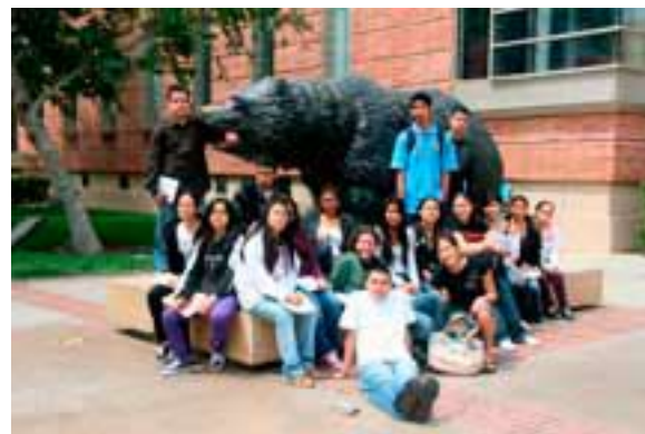
Southern California College Tour

Twelve years ago, East Palo Alto Charter School was founded as an experiment: what would happen if a committed group of families and teachers came together to start a school that would truly meet the educational needs of this community? And three years ago, an additional question was added: what if we expand our school with the explicit goal of preparing our students for college success?